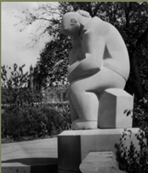
Photo: Tom Bass The Student 1953 (sandstone), Main Gates, University of Sydney

This will be a poignant celebration when Bass walks through the Great Hall, twenty-five years after completing The Arts and The Sciences for the niches on this neo-Gothic building, commissioned and unveiled by Lloyd Rees AC CMG in 1984.